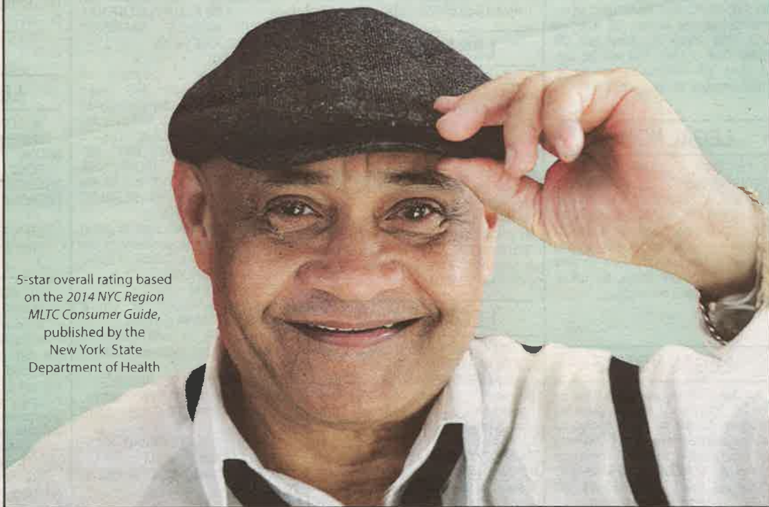
5-star overall rating based on the 2014 NYC Region MLTC Consumer Guide, published by the New York State Department of Health