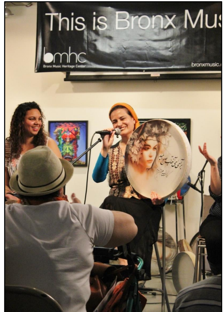
The Bronx Rising! series occurs monthly and features music, film and spoken word of the borough.