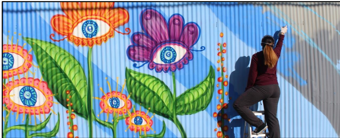
WHEDco partnered with BX Arts Factory to design and install a mural in Melrose, near the site of Bronx Commons