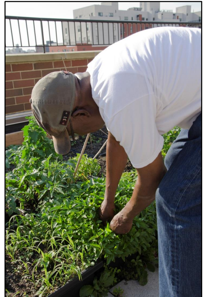
In 2015, residents of Intervale Green, WHEDco's second housing development, grew nearly 1,000 lbs. of fresh produce on the Rooftop Urban Farm.