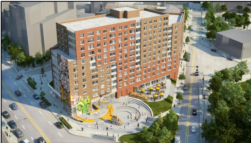
Bronx Commons, WHEDco's third affordable housing development, is scheduled to break ground in 2016.