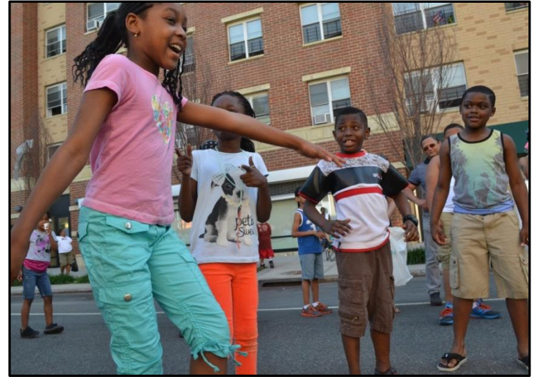
WHEDco engaged hundreds of community members by hosting Bronx Summer Fest on the Boulevard for two Saturdays in June.