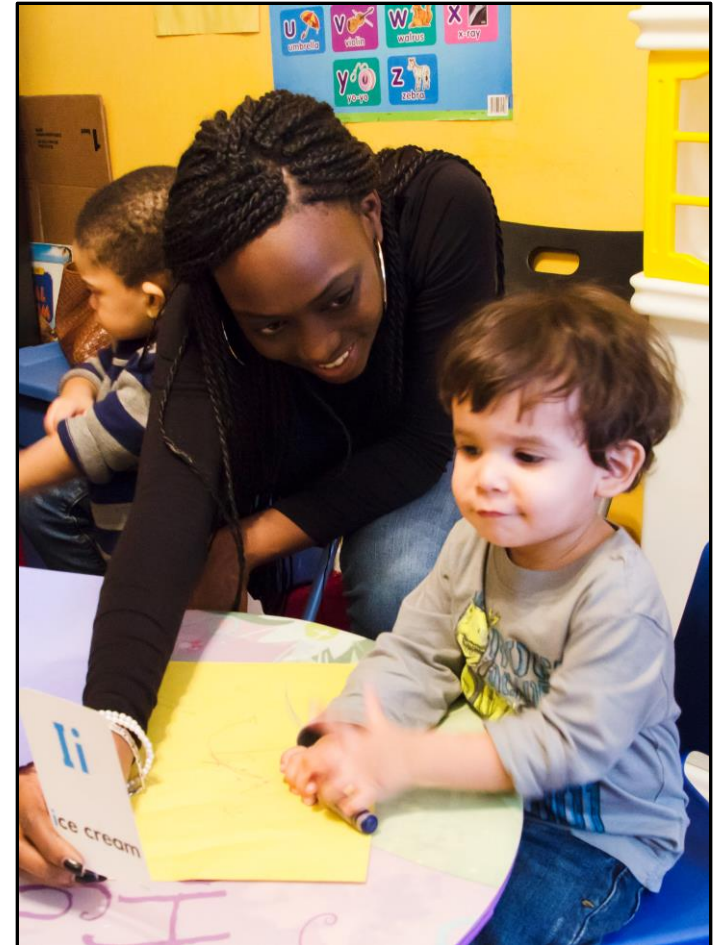
WHEDco's Start Right Up initiative helps home-based childcare providers in our network deliver a creative curriculum designed to narrow the language gap.