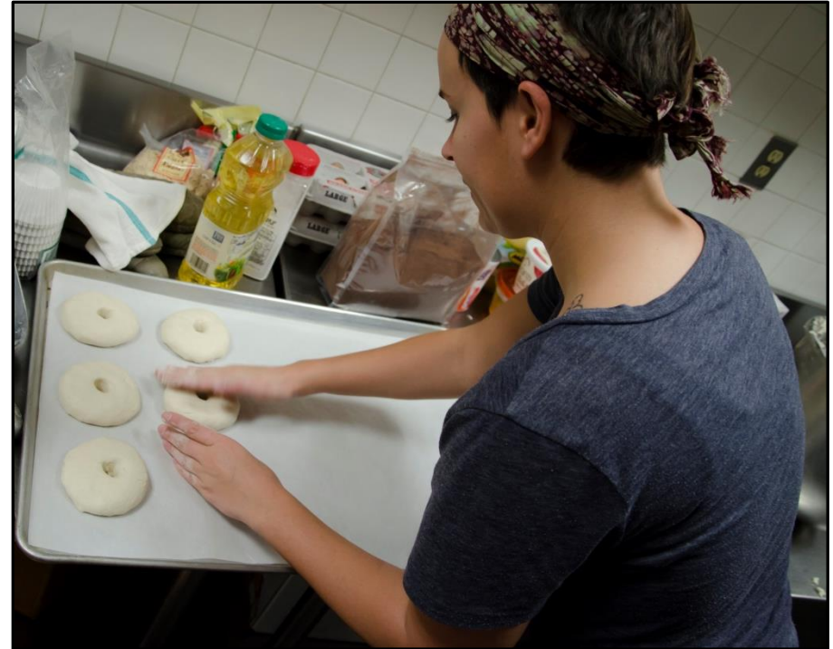
Sans Bakery, a gluten free company, operates out of Bronx CookSpace.