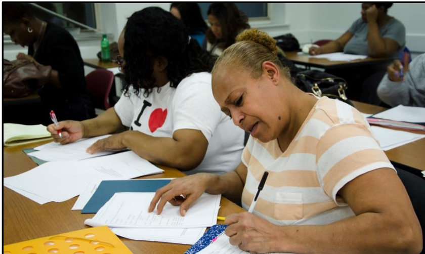
WHEDco's Childcare Training Institute helps women increase revenues and improve the quality of care they provide.