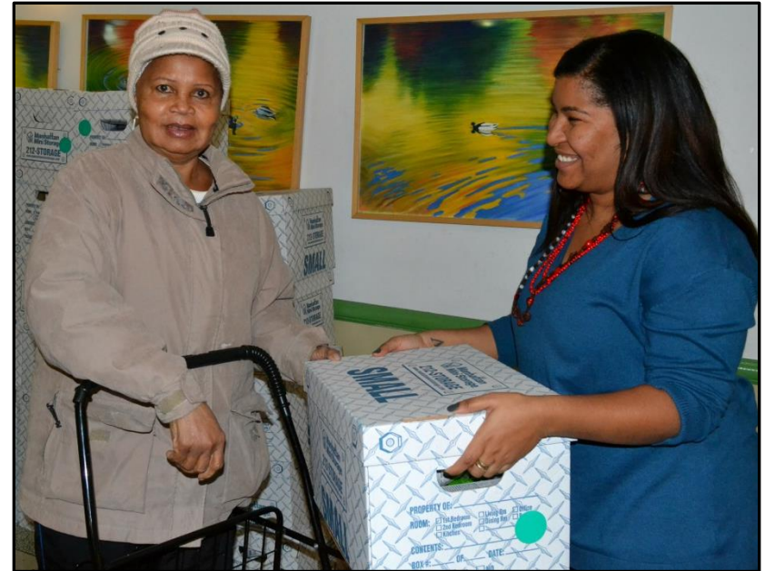
WHEDco's Family Support staff served an average of 450 people each month through the Community Food Pantry.