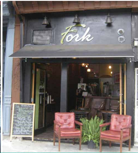
Storefront improvement on Myrtle Avenue in Clinton Hill - before & after

Last year Avenue NYC also funded the Pratt Area Community Council (PACC) in Business Attraction. PACC staff hosted 'Rolling Up the Gates' events, where potential entrepreneurs toured vacant retail spaces in Brooklyn's Fulton Street retail market. With Avenue NYC funds, PACC upgraded this event to include business development workshops for business owners. The R.U.G. Program had more than 500 participants and assisted more than 25 small businesses open both in and out of the organization's catchment areas. This year, PACC will use Avenue NYC funds to expand the services of its R.U.G. Program in order to continue to reduce the vacancy rate.