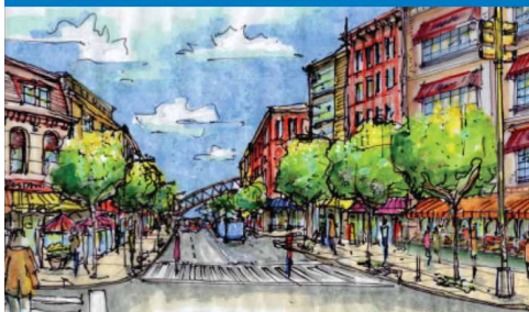
Retail attraction collateral for Port Richmond Avenue

We're looking for a good furniture store. In fact, we're looking for several.