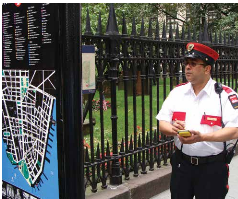
Alliance for Downtown New York

To learn more about the awards, visit www.nyc.gov/sbsawards .