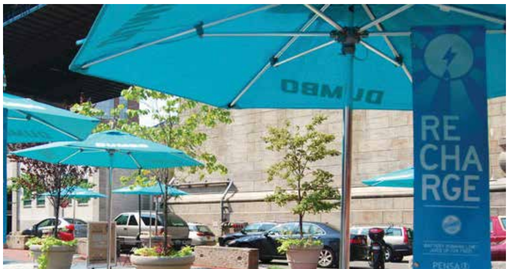
Free solar-powered cell phone charging stations in DUMBO