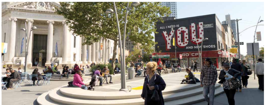
Downtown Brooklyn Partnership