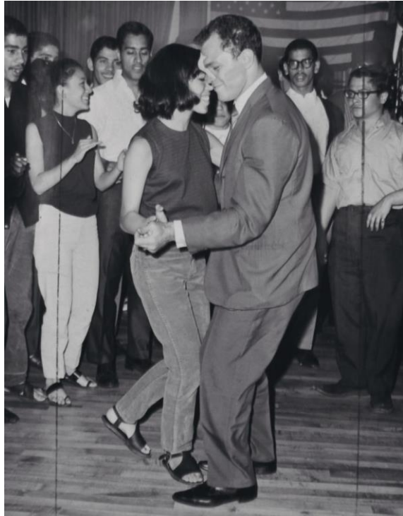
2 An undated photo of boxer Carlos Ortiz dancing with a female fan.

The South Bronx staple was a favorite performance venue for Latin music stars such as Tito Puente and Willie Colon.