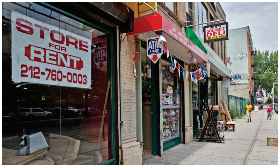
WHEDco works with property owners to market vacant retail space, and offers tours to potential retailers.

As a result, Southern Boulevard is slowly transforming into a safer, more vibrant commercial corridor. As of 2014, the SBMA has 38 members, out of the 100 businesses in the corridor. Through targeted technical assistance, WHEDco has helped small businesses remain on the Boulevard and attracted new businesses. The SBMA successfully organized against the opening of two new liquor stores in the area, which would have attracted crime and failed to meet other, more pressing shopping needs.