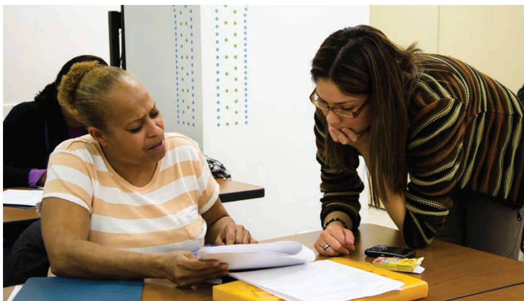
WHEDco uses classroom instruction and one-on-one technical assistance to serve each provider’s needs.

In recognition of the depth and breadth of the organization’s expertise in home-based childcare, the New York State Office of Children and Family Services (OCFS) awarded WHEDco a contract to screen unlicensed childcare providers for health and safety requirements. Unlicensed providers are paid by the City to care for children whose families receive public assistance or are eligible for city-subsidized childcare. These providers are often friends or family members. WHEDco’s goal is to transition care-